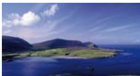
burra sound to hoy - charles tait

There is no shop on the island and the Post Office is on Monday and Friday from 7.30am till 9.30am and on Wednesday from 11.30am till 1.30pm.