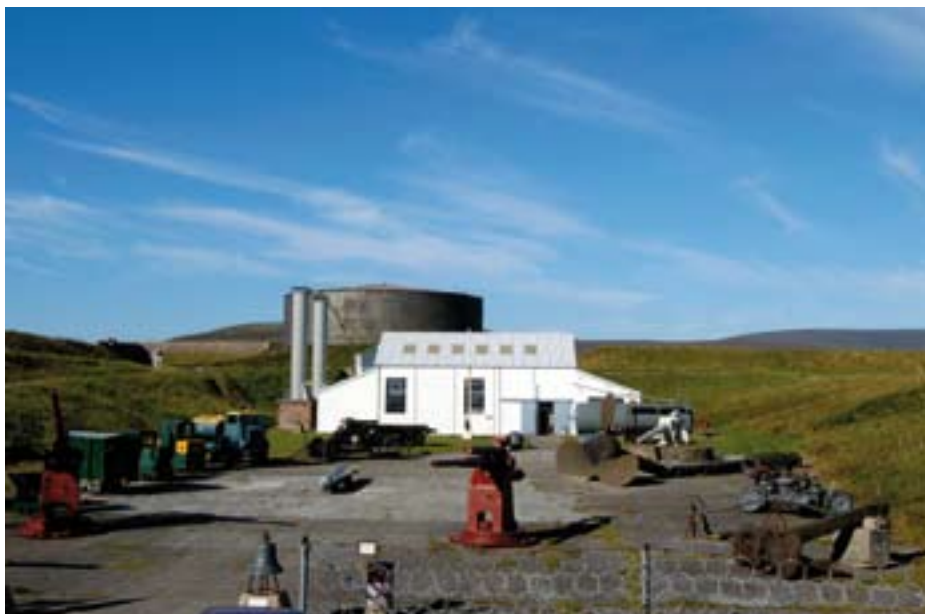
visitor centre outdoor display - charles tait

Hoy's major contribution to Orkney's heritage came in the 20th century when in 1914 Scapa Flow became the base of the Royal Navy's Grand Fleet. which sailed and engaged the German High Seas Fleet at the Battle of Jutland on 31 May, 1916. The captured German fleet was interned in Scapa Flow and subsequently scuttled on 21 June 1919. During World War II thousands of navy personnel were based at Lyness and the now deserted naval base has been converted to a visitor centre with many exhibits from both world wars and the scuttled German fleet. In addition there is an audio visual display within the remaining giant oil tank.