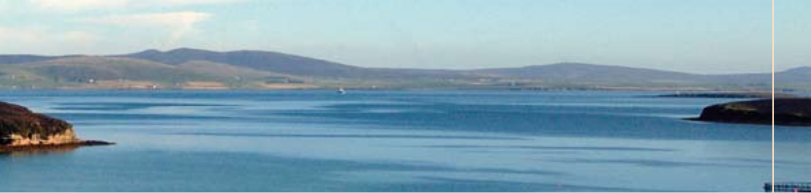
Pegal bay, hoy - charles tait