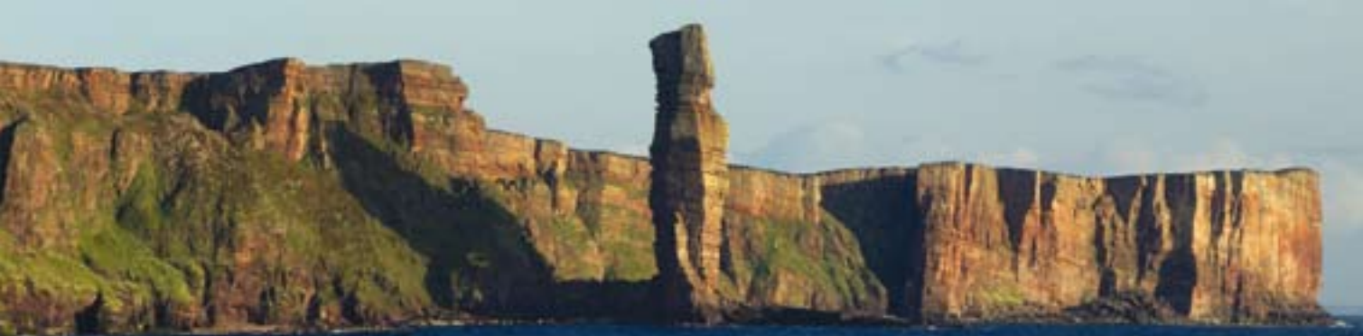
west face of hoy - drew kennedy

8 Hoy High & Hoy Low Lighthouses, Graemsay: Completed in 1851 Hoy High's white 108-foot tower tapers to a balcony supported by Gothic arches. At the foot of the tower are keepers' houses, built in a style reminiscent of Assyrian temples.