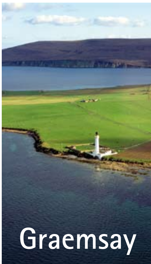
hoy high lighthouse, graemsay - charles tait

St Columba's, Longhope – Church of Scotland. All denominations welcome. Services advertised locally.